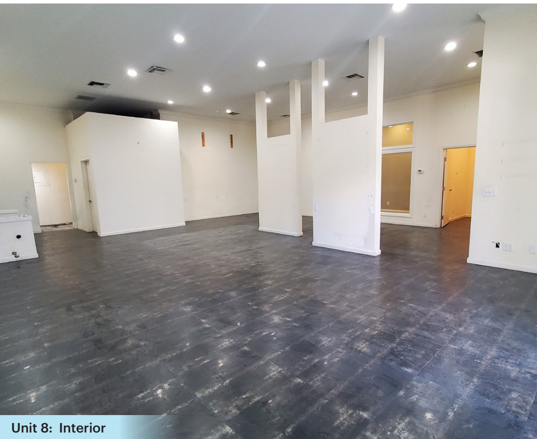
Unit 8: Interior

Five Points Shopping Center is located within the hub of Santa Barbara's daily needs retail corridor, at State St. and La Cumbre Rd. Often described as the trade area's dominant grocery-anchored center, this 144,573 SF property is visible from Highway 101 and adjacent to La Cumbre Plaza. Co-tenants include Smart & Final, Ross, CVS, Petco, Starbucks, and more.