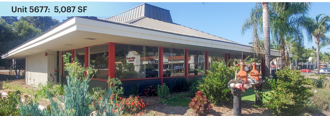
Unit 5677: 5,087 SF